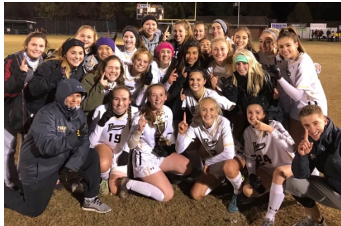
2017 NoVIS Champions